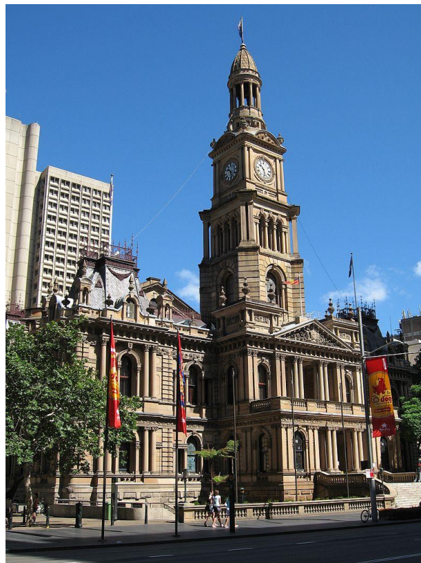
Sydney Town Hall