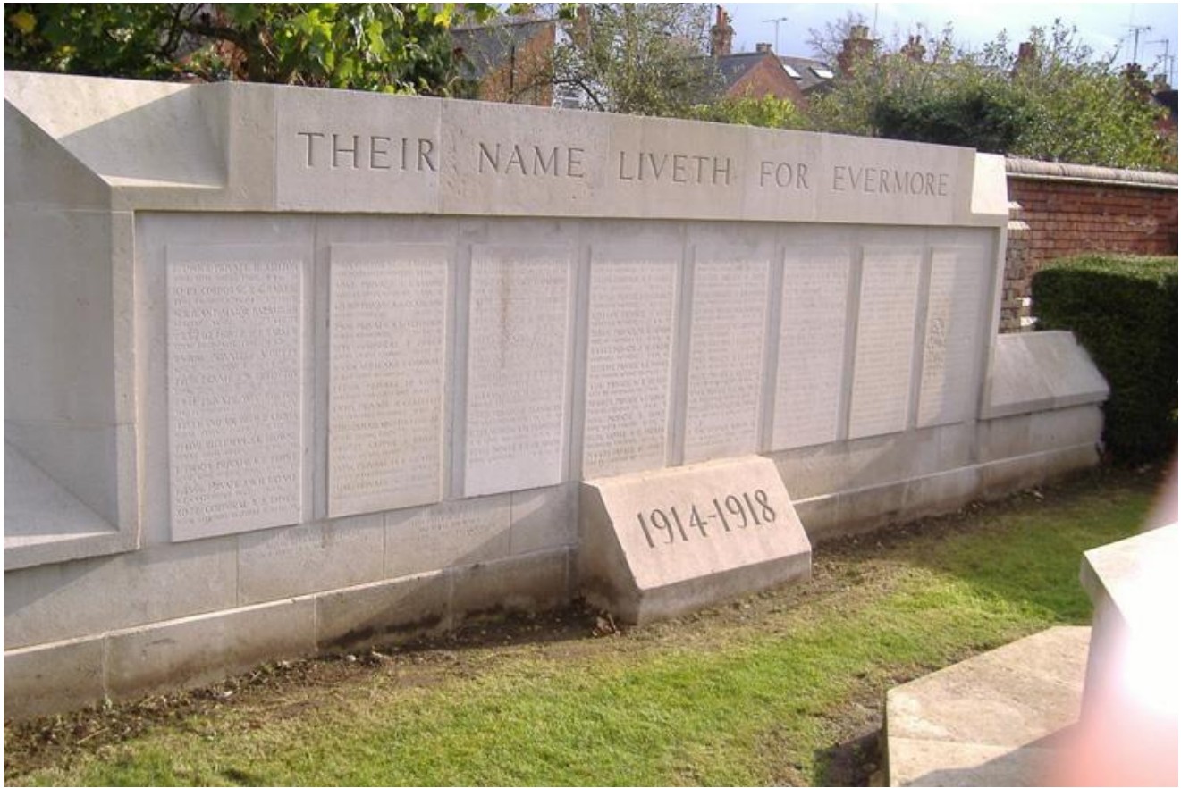
Photo of Pte T. E. Lester's name on the Screen Wall Memorial in Reading Cemetery, Reading, Berkshire, England.